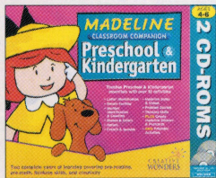
Madeline™ Preschool & Kindergarten

Please see the back of this certificate for details.