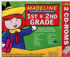
Madeline™ 1st & 2nd Grade

This 2 CD-ROM collection is the fun and comprehensive way to ensure a successful start in school. Children build skills in phonics, reading, early math, and creativity.