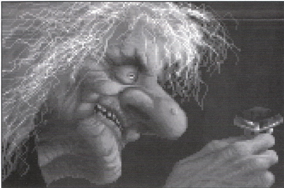
Gladstone is no longer safe from Scotia, now that she has the Nether Mask!